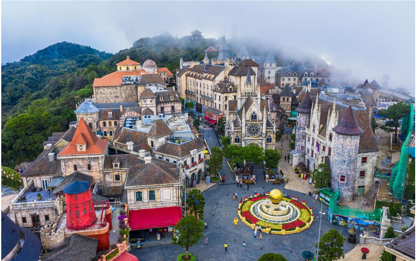
The overview of Ba Na Hills

After lunch, transfer back to Danang . Free shopping at Han market