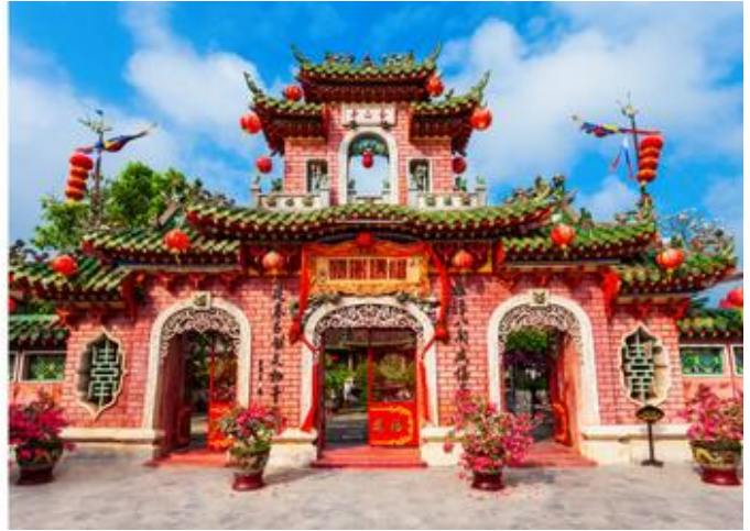
Fukien Association temple