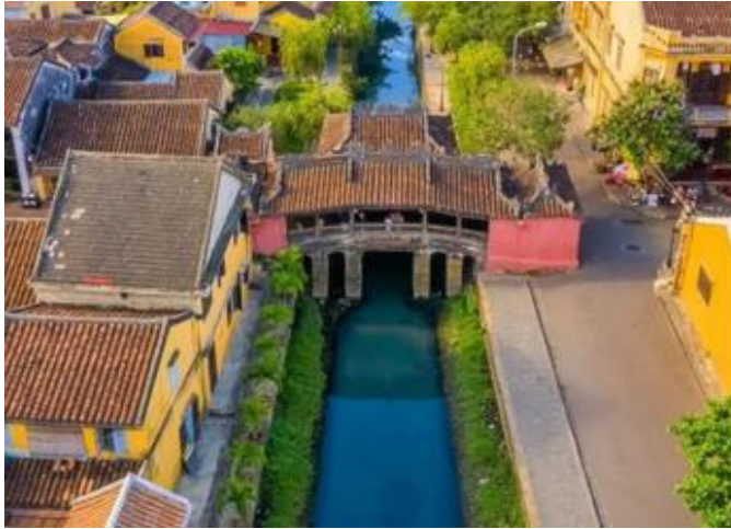
Japanese Covered Bridge Pagoda

bridge on this site and was constructed in 1593 by Japanese community of Hoi An to link the Town with the Chinese Quarter across the stream, besides looking at Fukien Association temple, Ceramic Museum and Chua Ong Temple .